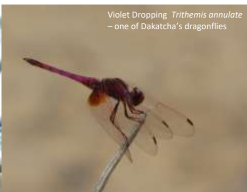
Violet Dropping Trithemis annulata – one of Dakatcha's dragonflies