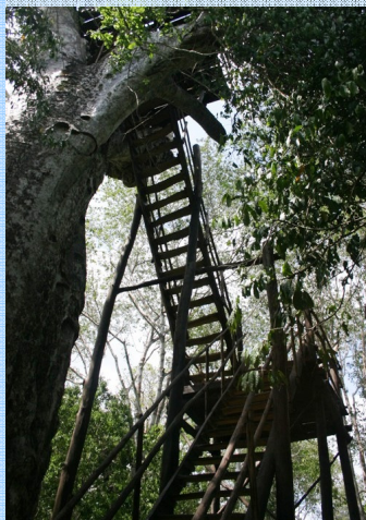
Gede Ruins Tree Platform

Gede tree platform is now back to full operation.