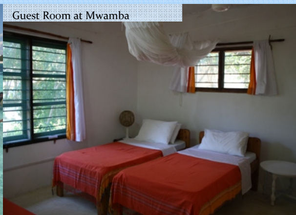
Guest Room at Mwamba