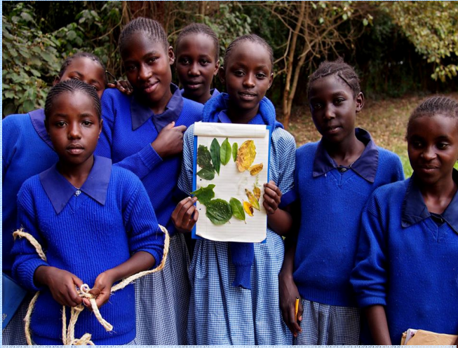
Students from St Mary’s Primary School, Karen

It was all fun and learning at Karara (Nairobi Office), hosting young environmental enthusiasts from the neighboring, St. Mary’s Primary School Karen. The young scholars took part in exciting educative games; as we engaged them on emerging environmental issues. This is just the launch of a series of such events targeted at reaching out to as many young people as possible.