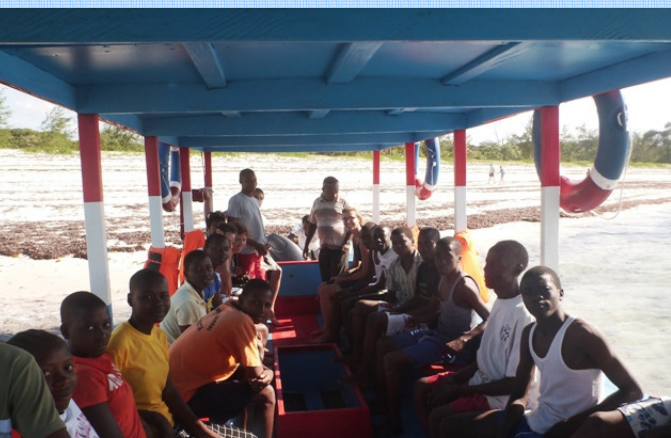
ASSETS Students going snorkeling for the first time ever, to experience life under water