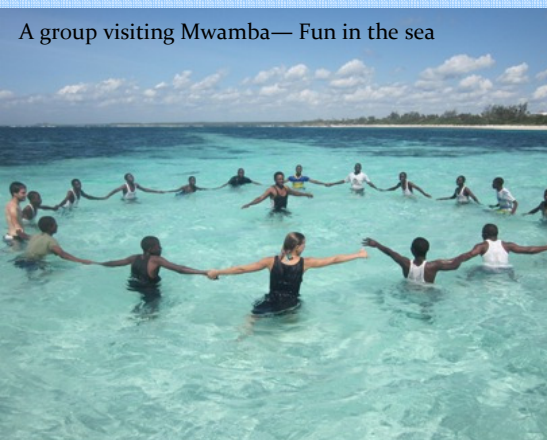
A group visiting Mwamba— Fun in the sea

Mwamba Field Study Centre provides simple and pleasant, friendly and relaxed full-board accommodation for all interested visitors, including researchers and conservationists, and offers opportunities for volunteers to get involved as well as facilities for small workshops and seminars. We are located just 80m off the dazzling white sands of Watamu's world-renowned beach and National Marine Park.