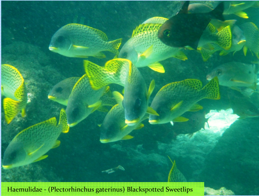
Haemulidae - (Plectorhinchus gaterinus) Blackspotted Sweetlips

We often don't think that the Bible has something to say about research. Of course, the issue of scientific research isn't explicitly addressed in the Bible. After all, what we call science came to be much later. However, we do know that the Bible can be applied to all aspects of our lives and that includes our vocations. So while there isn't such thing as a Christian transect (a field technique used in much of ecology), the Bible can give us principles to apply to the process of collecting field data.